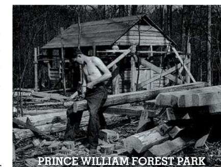
PRINCE WILLIAM FOREST PARK

The Civilian Conservation Corps put several hundred thousand unemployed men to work in the Great Depression to build state and national parks and roadways for public use. Many of the park cabins they built still stand today, including several in Prince William Forest Park near Triangle, Virginia. During World War II, the Office of Strategic Services, the precursor to the CIA, trained intelligence operatives at the camp. Today, the cabins are available to rent as lodging for visitors to the park.