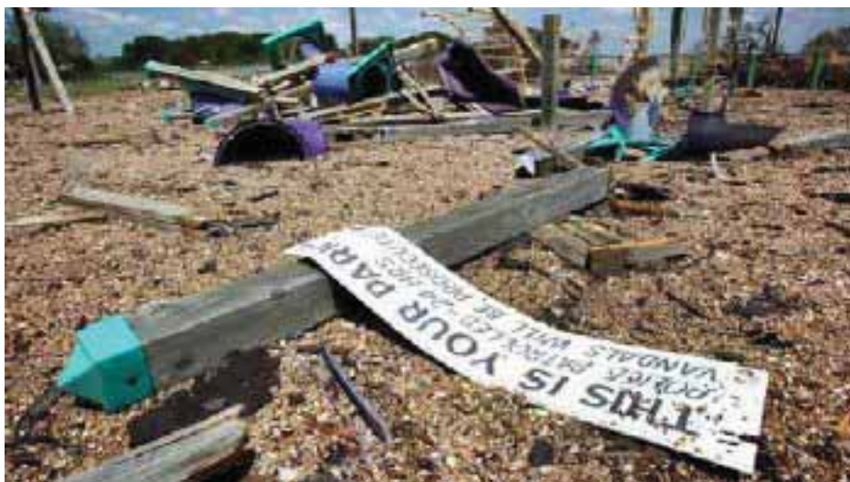
The center of the explosion was located less than 200 feet from West's city park.