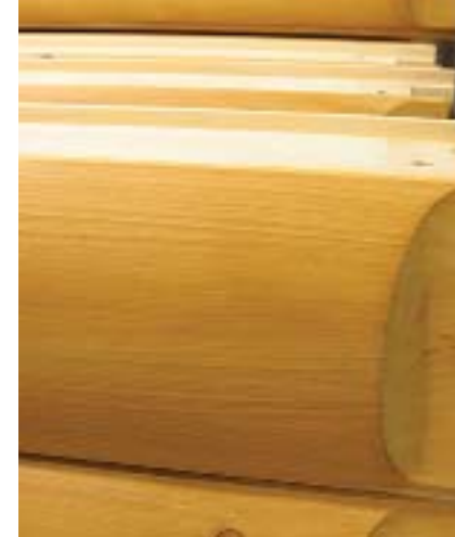
Timber Block's insulated logs could easily be mistaken for traditional full-core milled logs, as their interior and exterior profiles belie the superior R-30 insulation hidden within.

According to the Log Homes Council, the average log home is approximately 15 percent more energy efficient than its stick-framed counterpart, largely because of the thermal mass of logs. Even with this solid base, tightness and efficiency can be improved dramatically. From innovative insulation ideas to re-vamped wall systems, log-home manufacturers are providing today's customer with plenty of competitive options for creating a highly energy-efficient home.