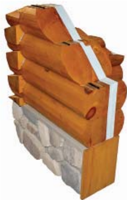
Golden Eagle Log Homes combines the thermal mass properties of full logs with modern foam insulation to create its energy-efficient High Performance Full Wall Log System.

vative solutions to the energy-efficiency challenge, and while the pros and cons of any one system over another can be debated, the competition can only mean good news for the consumer.