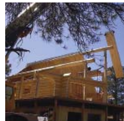
Eagle Panel Systems' R-50 Integroove roof panel features a rigid insulation core fronted by tongue-and-groove pine to match the natural log-home aesthetic.

With a firm knowledge of the exciting new developments on the market, as well as an understanding of the longstanding benefits of building with logs, you'll be sure to end up with a modern home still steeped in an enduring, time-honored tradition. CBC