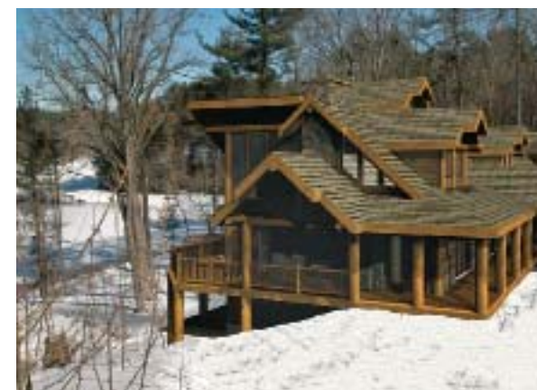
ABOVE: These renderings by Wisconsin Log Homes show homeowners precisely how their proposed design will look and feel on their exact site when built.