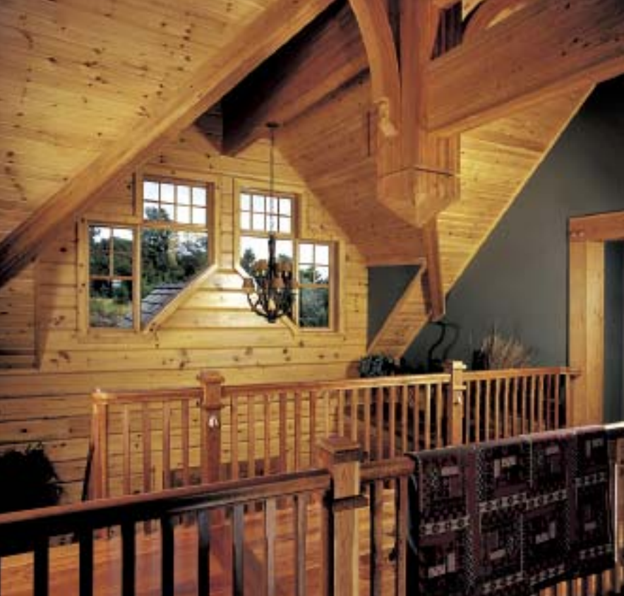
True North Log Homes borrowed ideas from timber-frame architectural designs to create this innovative king-post system, which allows for larger open spaces within the home. This system uses the load-bearing upper ridge post to support hanging beams that extend across the roofline.