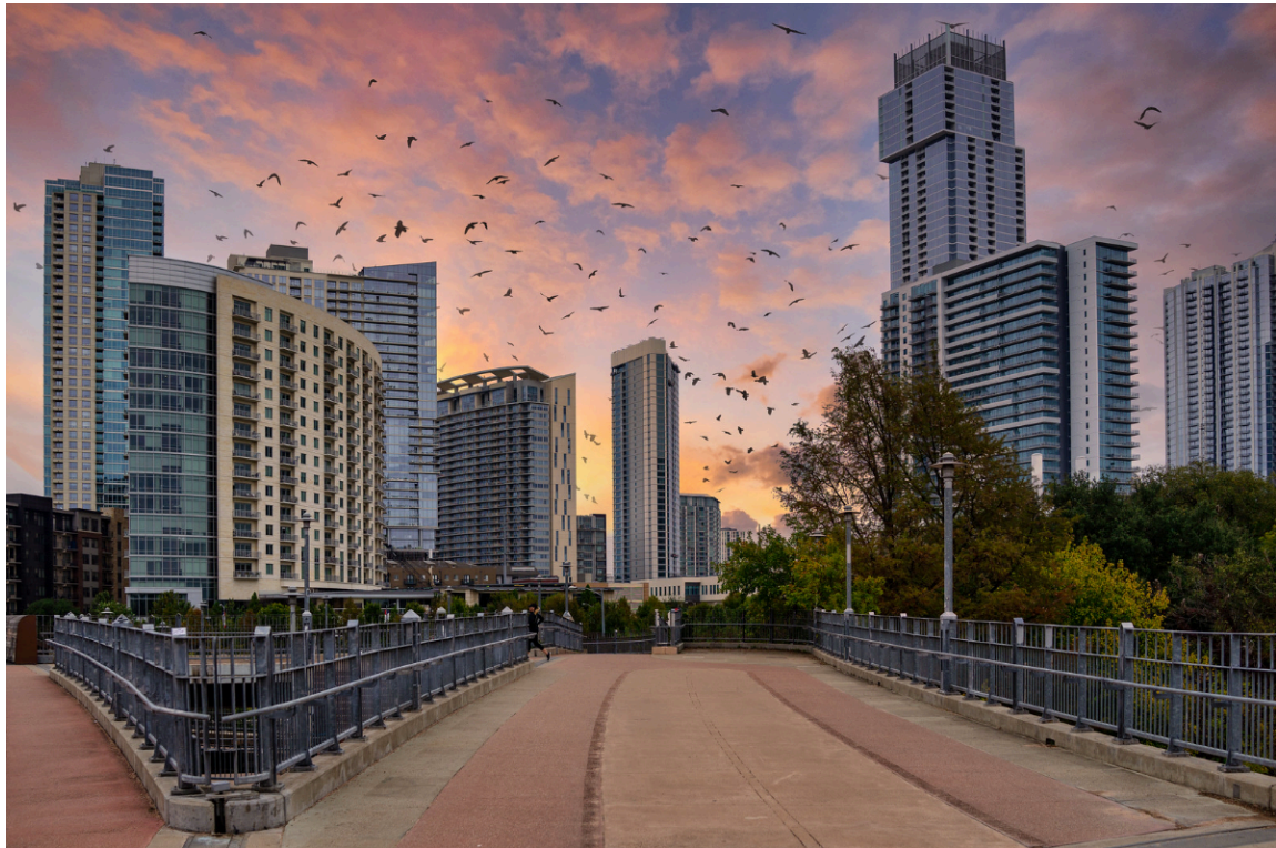
Downtown Austin, Texas

Your drive time: Approximately 8.75 hours