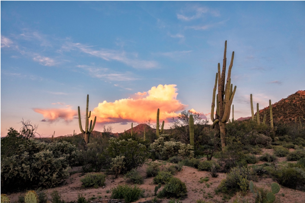
Saguaro cacti near Tucson, Arizona.

Your drive time: Approximately 9.25 hours