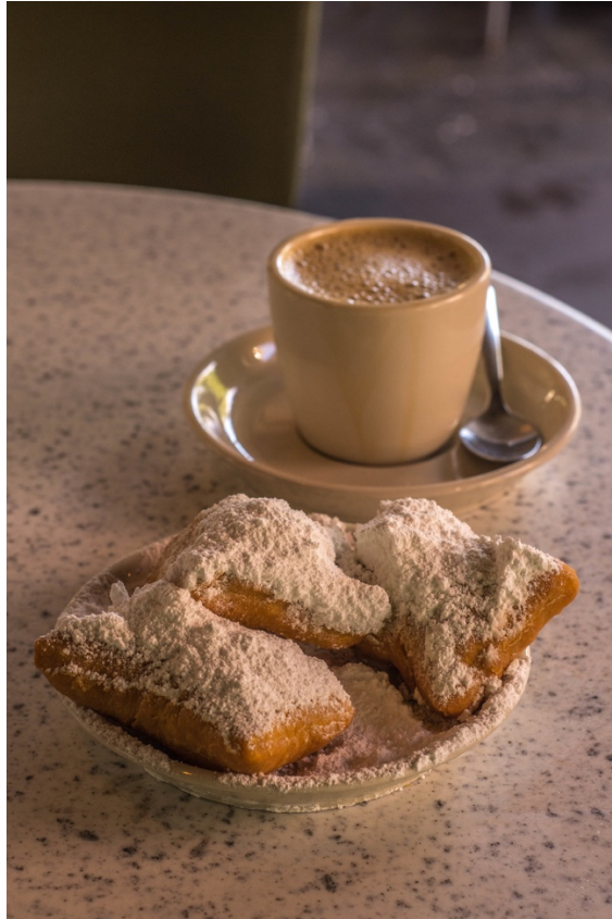
Chicory coffee and beignets at Café du Monde.

800 Decatur Street New Orleans, LA 70116 504-587-0833