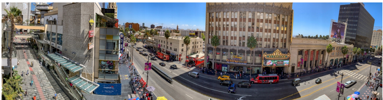
Tourists explore the Hollywood Walk of Fame along Hollywood Boulevard.

Afterward, head back inland for a visit to Hollywood and a chance to rub elbows with the glitterati.