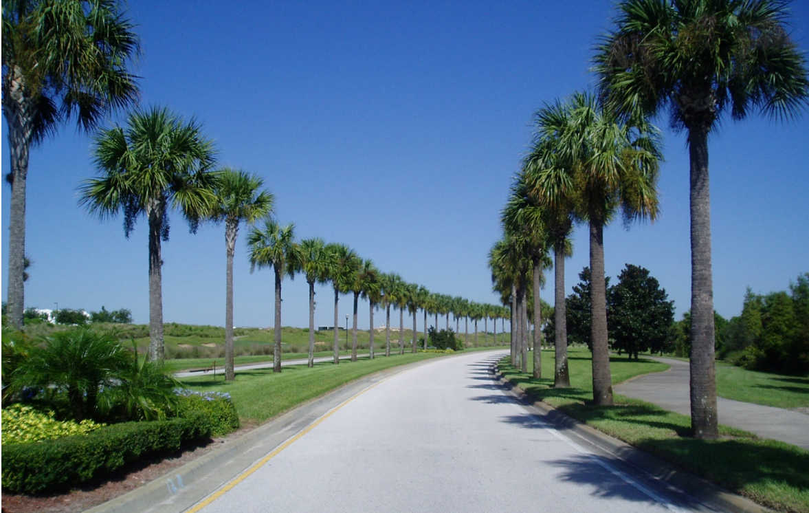
Roadside palm trees, Florida

You're beginning your trip with a drive through the Sunshine State, and we hope you'll have great weather along your way. Start your day at Keke's Breakfast Café , a highly reviewed local chain that serves up deliciously prepared comfort foods. Keke's has several locations throughout central Florida, so if the one listed below isn't convenient to your starting point, click here to find a different location.