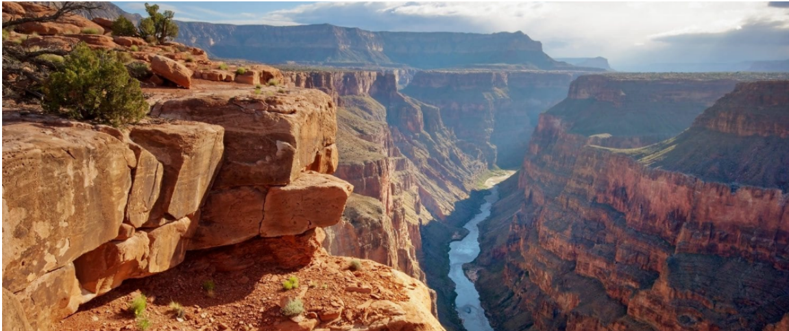
Grand Canyon National Park

Your drive time: Approximately 7.25 hours