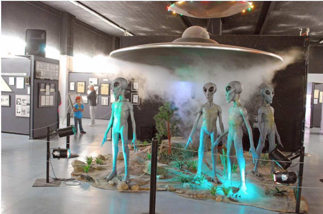
International UFO Museum

Your drive from Roswell to Albuquerque today only takes about four hours, so you have flexibility to sleep in and take it easy until check-out time. Enjoy a complimentary continental breakfast at the hotel, then head out for a morning of alien adventures!