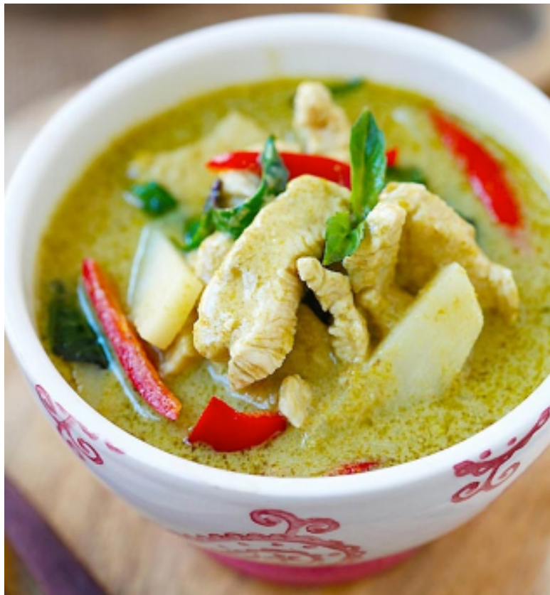
Green curry at Kik’s Thai Food

Your route: International UFO Museum and Research Center to Kik’s Thai Food