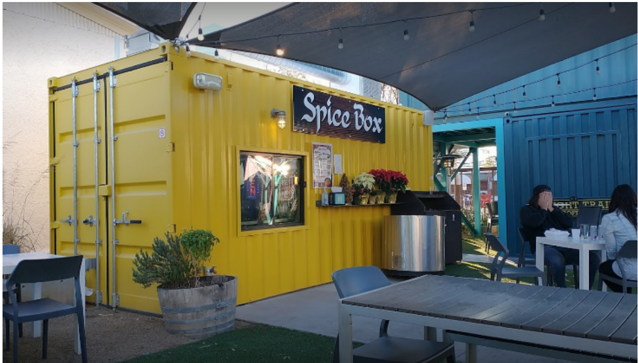
Spice 'N Box

Your route: The Westin Phoenix Downtown to Spice 'N Box