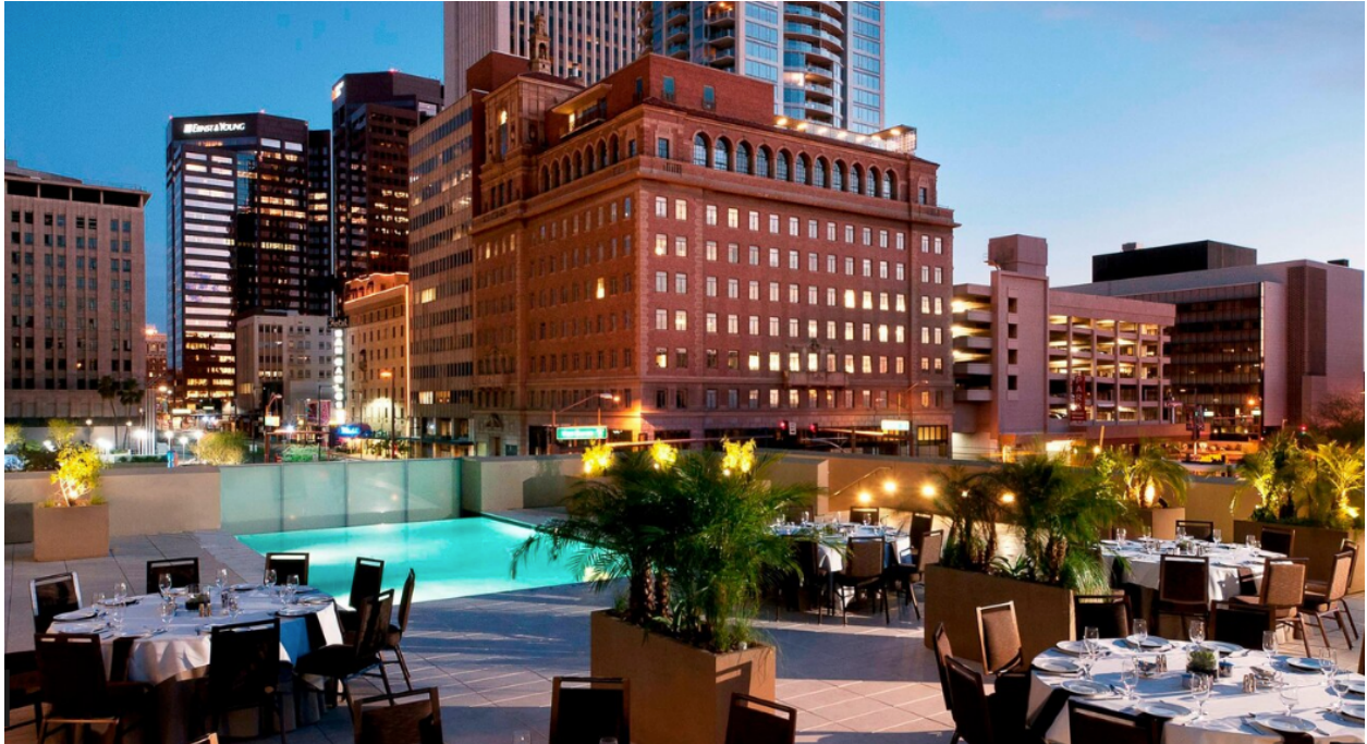
The Westin Phoenix Downtown

Rate: $249/night plus taxes and fees, $280.31 total Valet parking: $38/day Check in: 3 p.m. Check out: 12 p.m. Cancellation policy: You may cancel your reservation for no charge before 11:59 p.m. local hotel time on Tuesday, October 12, 2021.