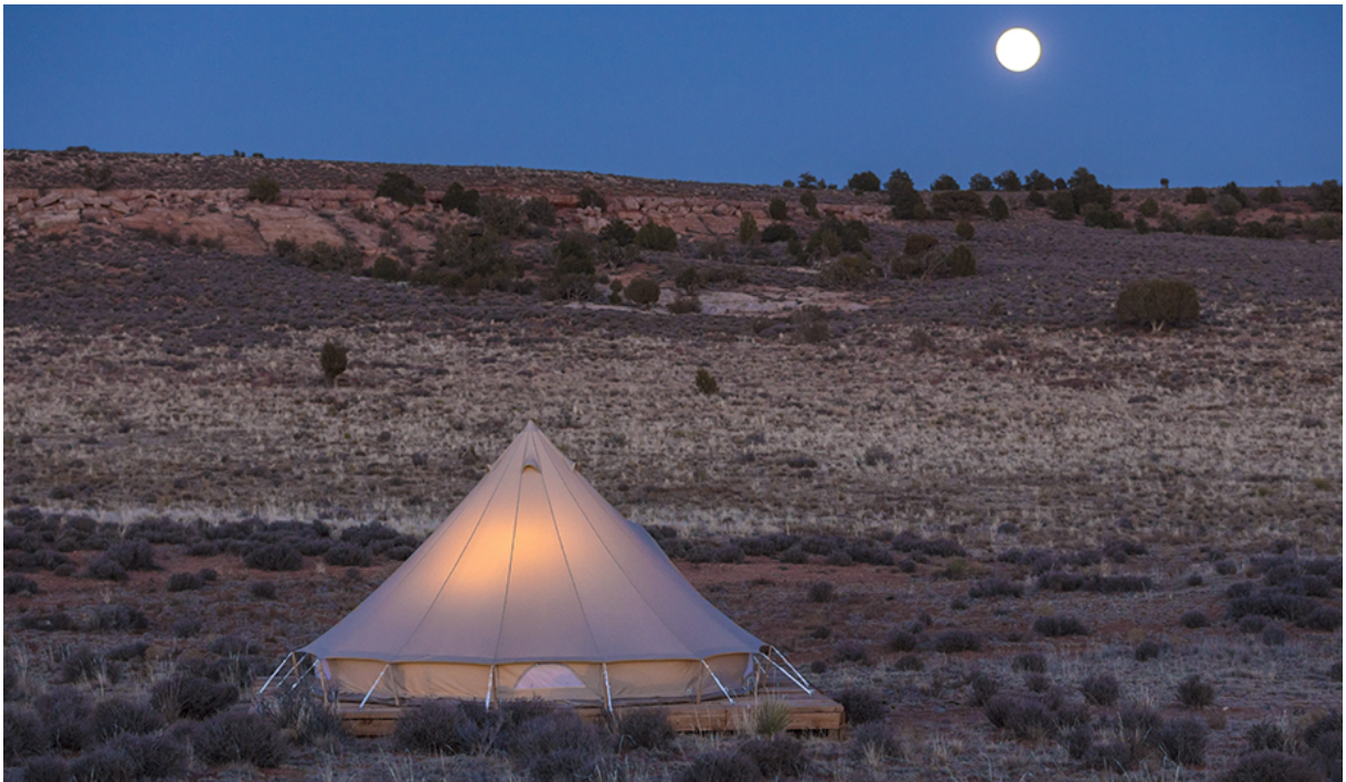
Shash Diné Eco Retreat

This glamping bed-and-breakfast offers a unique off-grid experience on the northern edge of the Navajo Nation, and it will likely create the most memorable night of your trip. Go in with no preconceptions and allow yourself to immerse yourself in a connection with this ancestral landscape.