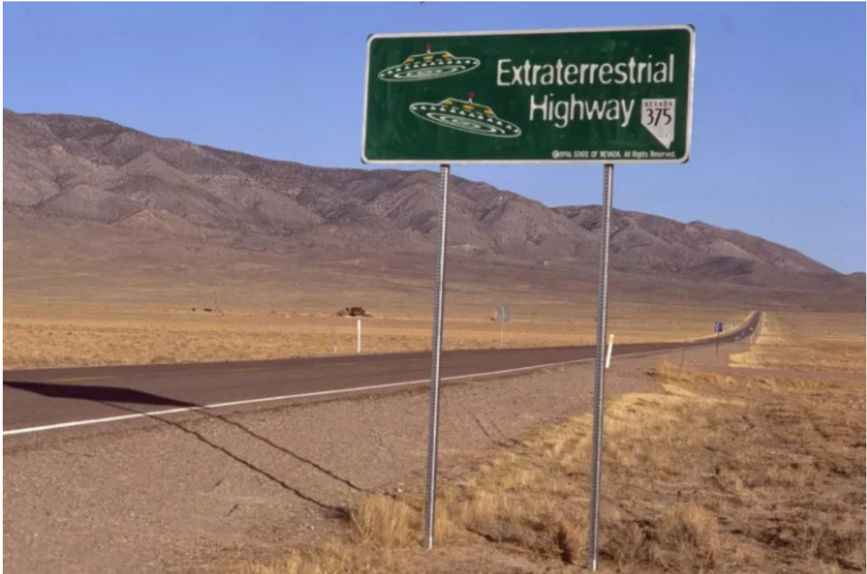
The Extraterrestrial Highway

Your drive time: Approximately 5.25 hours