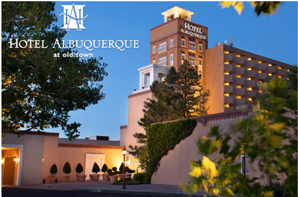
Hotel Albuquerque at Old Town

Your route: Casa Grande Trading Post to Hotel Albuquerque at Old Town