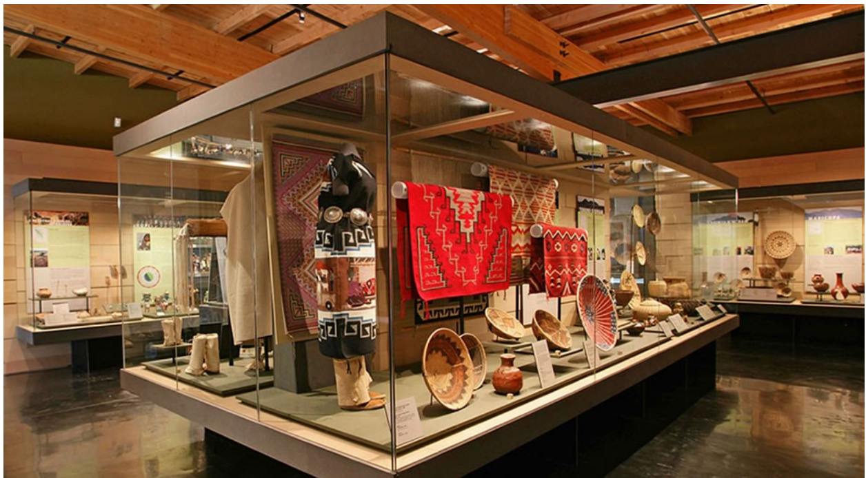
The Heard Museum

Your route: The Westin Phoenix Downtown to the Heard Museum