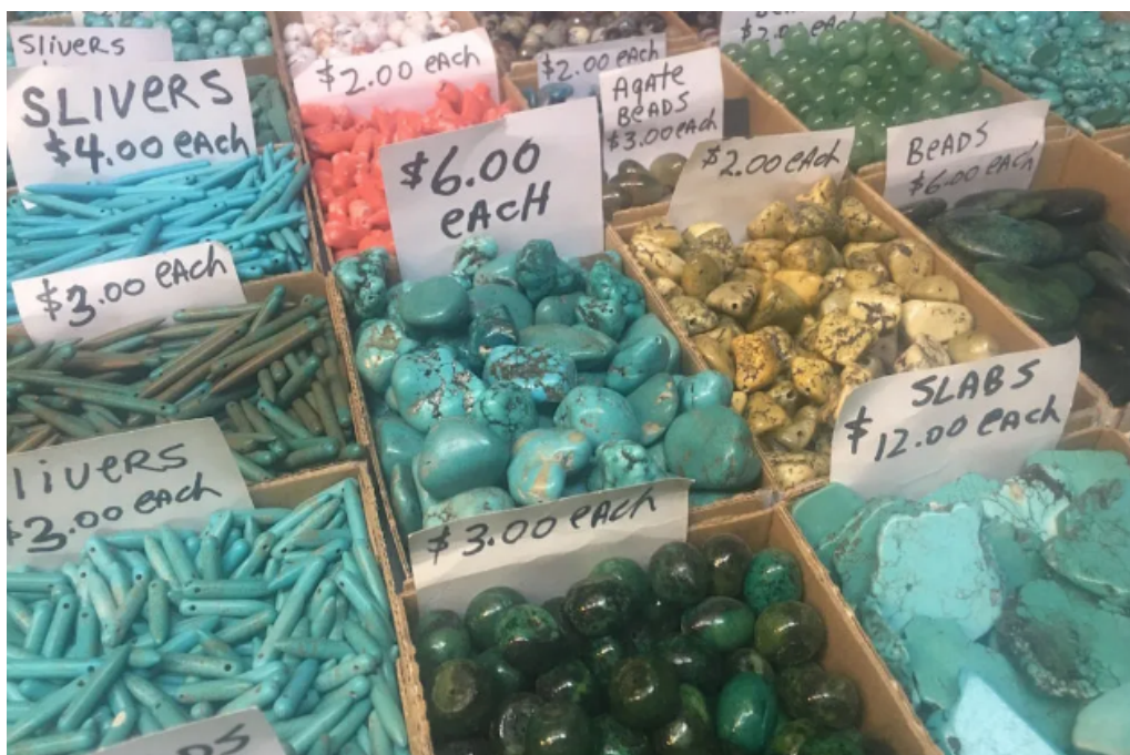
Casa Grande Trading Post

Your route: Alien Zone and Area 51 to Casa Grande Trading Post