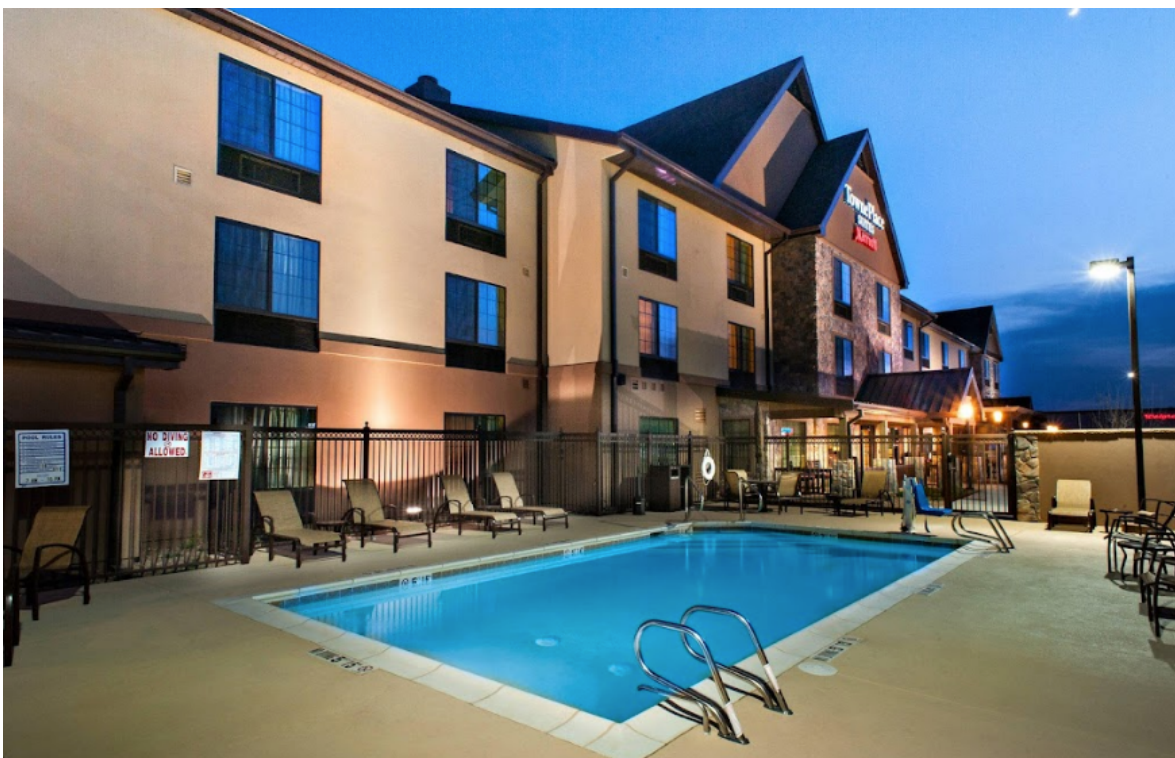
TownePlace Suites by Marriott Roswell

Your route: Can't Stop Smokin' BBQ Smokehouse to TownePlace Suites by Marriott Roswell