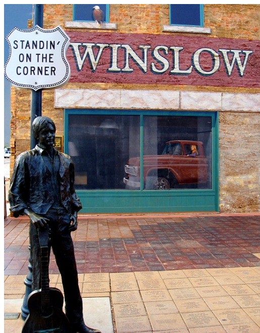
The Corner in Winslow, Arizona

Your route: Lacey Point at Petrified Forest National Park to The Corner in Winslow, Arizona