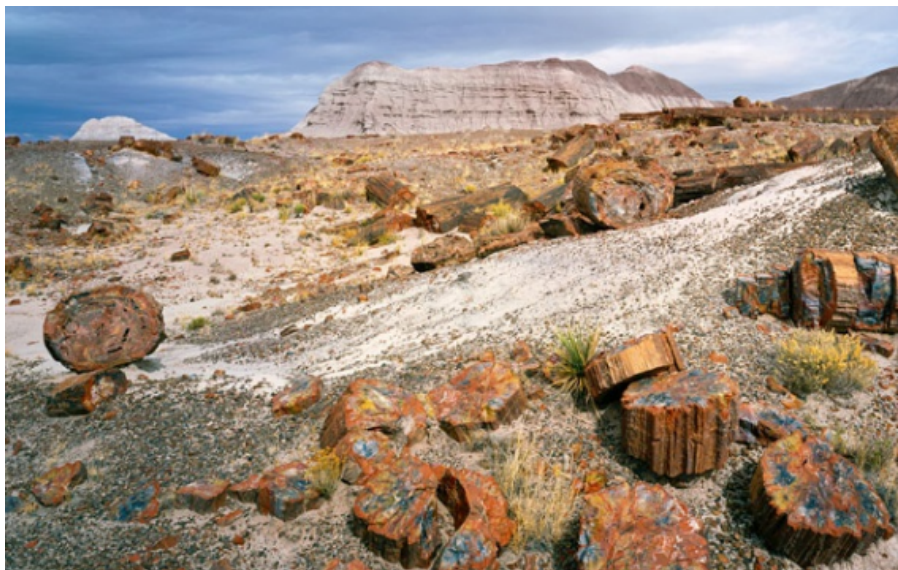
Petrified Forest National Park

Your route: Route 66 Railway Café to the Painted Desert at Petrified Forest National Park