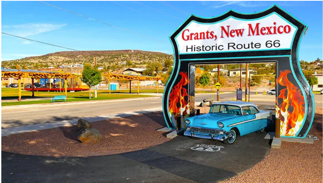
Route 66 Neon Drive-Thru sign

Your drive time: Approximately 7.5 to 8.25 hours (see route options listed after lunch stop)