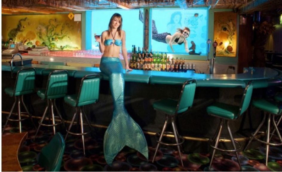
Mermaid Restaurant & Lounge

Afterward, finish out your night with a session of sipping.