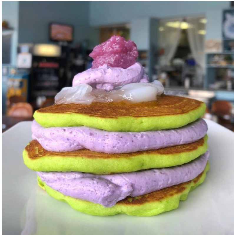
Truffles n Bacon Café

8872 South Eastern Avenue, Suite 100 Las Vegas, NV 89123 702-503-1102