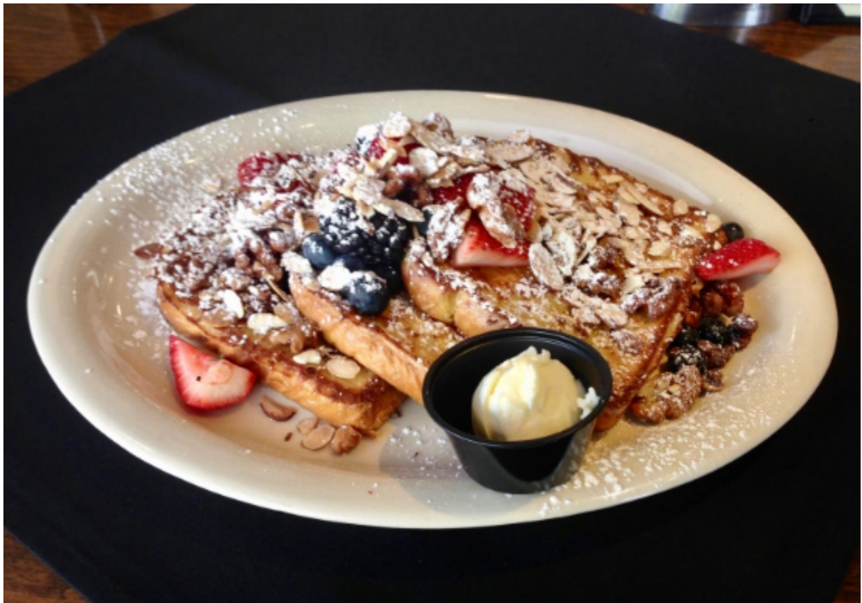
The Breakfast Club

Your route: The Westin Phoenix Downtown to The Breakfast Club