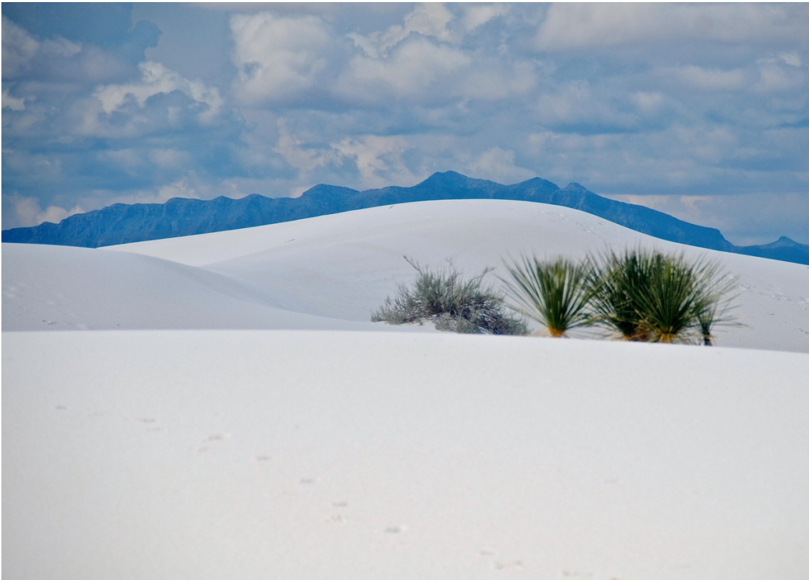
White Sands National Park

Your drive time: Approximately 3.75 hours