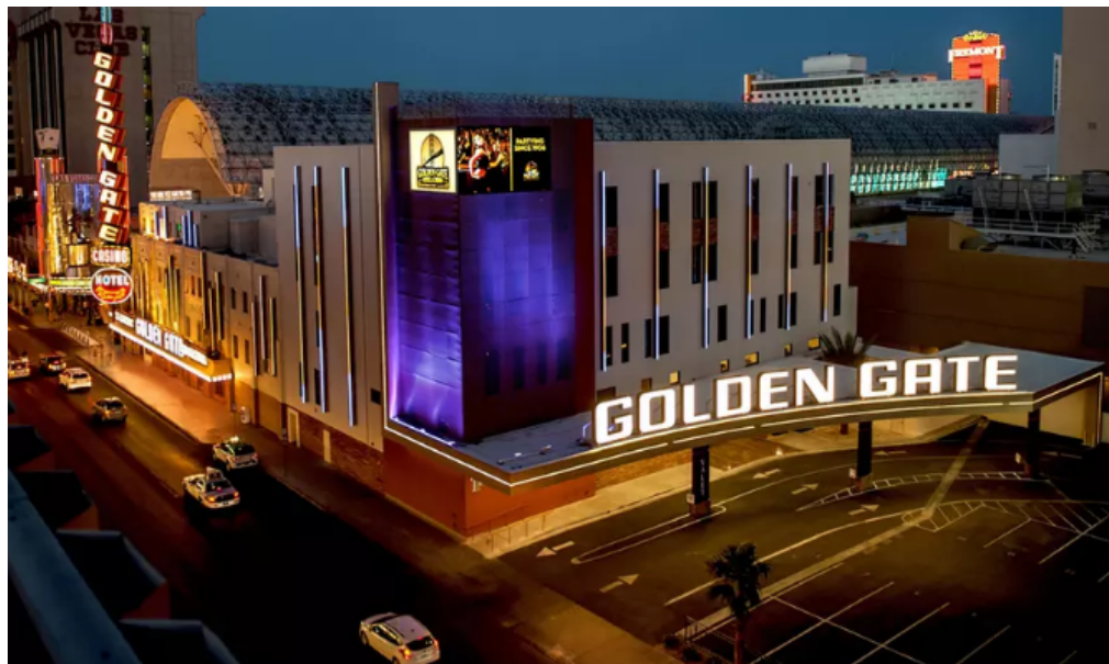
Golden Gate Hotel & Casino

Cancellation policy: To cancel, call 800-426-1906.