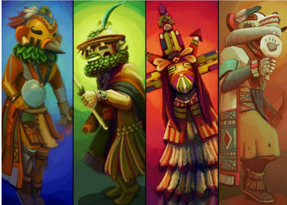
Hopi Cultural Center

Your route: Route 66 Railway Café to the Hopi Cultural Center