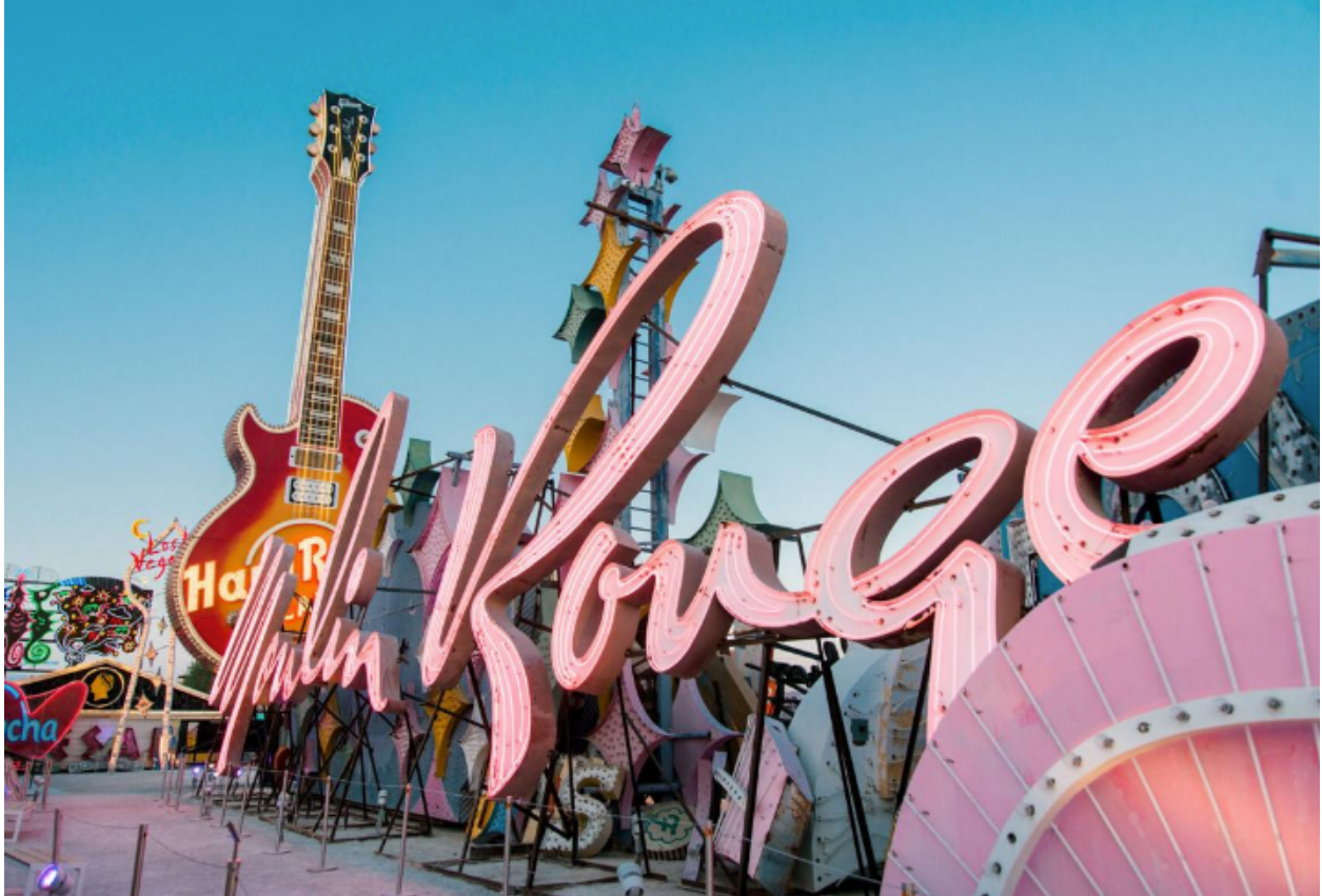
Neon Boneyard at the Neon Museum

Founded in 1996, The Neon Museum is a non-profit 501(c)3 organization dedicated to collecting, preserving, studying and exhibiting iconic Las Vegas signs for educational, historic, arts and cultural enrichment. The Neon Museum campus includes the outdoor exhibition space known as the Neon Boneyard Main Collection, the Neon Boneyard North Gallery, which houses additional rescued signs, and a Visitors' Center housed inside the former La Concha Motel lobby.